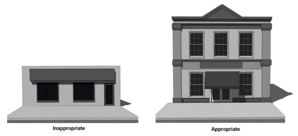
Figure 1: Examples of Inappropriate and Appropriate Architecture

The purpose of this document is to provide clear architectural design guidelines to property owners who are constructing new buildings or renovating existing buildings. These guidelines will also assist the Town of Mundare in objectively and consistently evaluating designs submitted for approval. This document provides architectural recommendations for aesthetic design principles only. All development proposals should adhere to appropriate building codes, safety requirements, Land Use Bylaws and other relevant regulations.