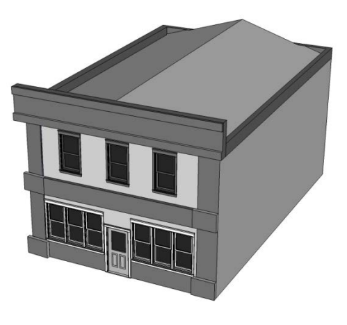
Figure 3: Pitched Roof

All pitched roofs, which includes gabled, hipped, and Quonset, roofs should incorporate a parapet or false façade to conceal the pitched roof from street view. The parapet or false façade should be articulated as outlined in Section 4.1.