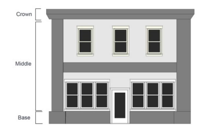
Figure 6: Horizontal Articulation Zones

The architectural style, materials, and colors of buildings stories should be match or be complementary to each other to create thoughtful and well designed transitions. Some building styles use architectural features or banding to define the space between the stories. In this case, the separating element needs to correspond and relate to the elements used in the crown zone.