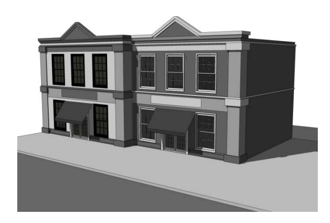
Figure 2: Example of Maintaining the Appearance of Narrow Frontages Through the Use of Setbacks and Colour