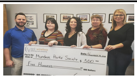
Mundare Parks Society receives proceeds from Wired internet promotion.

The town of Mundare has been raising money to build an outdoor pickle ball court for the community, led by the local Parks Society. Pickleball is a paddleball sport, like racquetball, that combines elements of tennis, badminton, ping-pong and table tennis. Two or four players use solid paddles to hit a perforated polymer ball, like a Wiffle Ball, over a net. It's played inside or outdoors on a badminton-sized court with a slightly modified tennis net. This sport has been gaining popularity as it is accessible for people of all ages and skill levels.